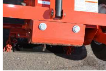
Carbide Skid Plate