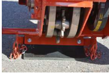
Carbide-Tipped Rotary Cutters