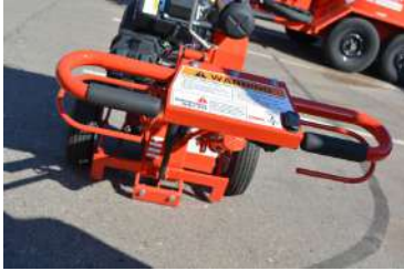
Ergonomic Handle Design

All Crafcro routers come with 17 standard features that are options on competitor models, making for a cost-effective choice. Top features include: