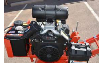
Dual-Stage Air Filter