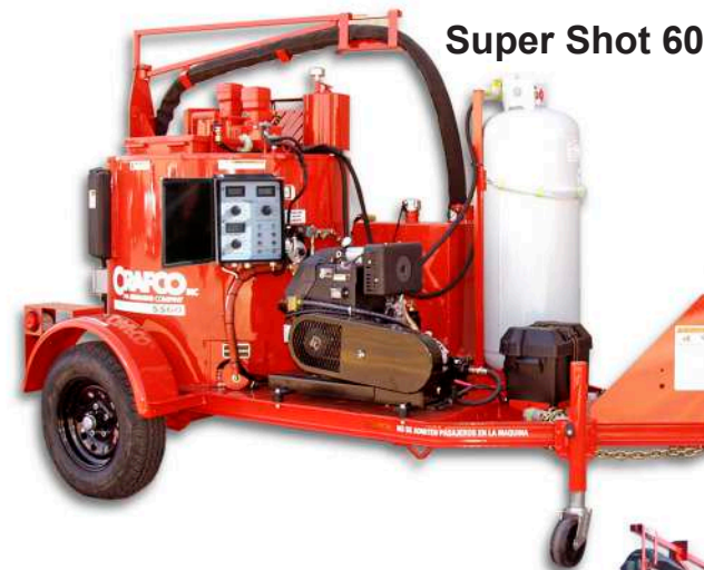
Super Shot 60

THE MOST TECHNOLOGICALLY ADVANCED MELTER/APPLICATORS AVAILABLE