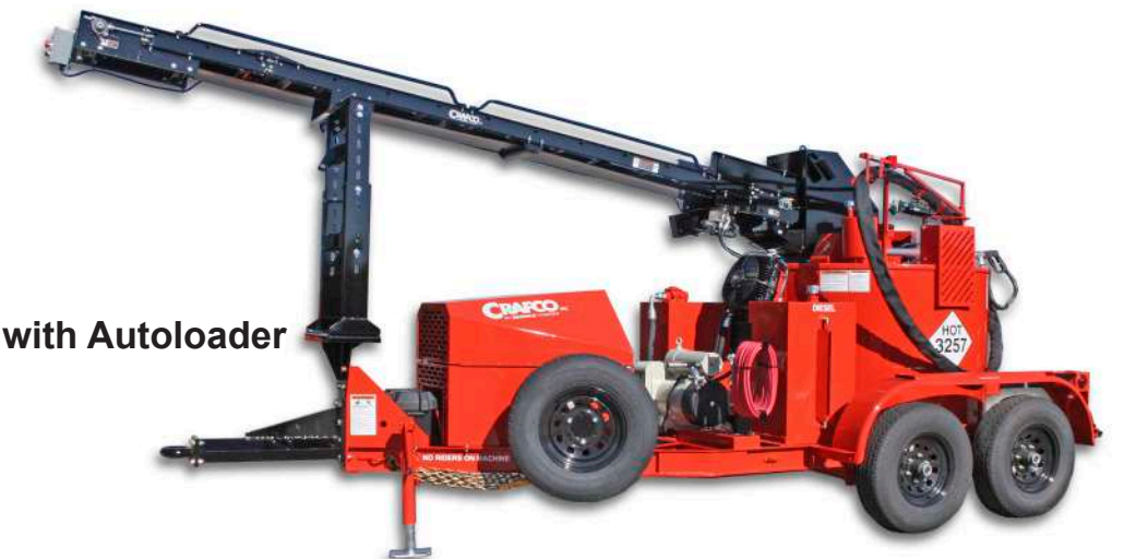
Super Shot 250 with Autoloader

The patented pump technology of the Crafco Super Shot melters is what makes the Super Shot the most productive and lowest maintenance melter in the industry. The Crafco patented pump is mounted inside the sealant tank. Mounting the pump inside eliminates material recirculation, outside plumbing, and high-pressure lines, while decreasing pump wear. The Super Shot pump will last many times longer than a conventional pump. Internal pumps require no packing which eliminates maintenance and results in more production on the job.