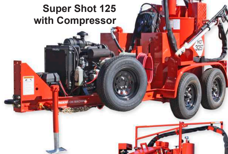
Super Shot 125 with Compressor

There are three sizes to choose from. The Super Shot 60 is a 60-gallon capacity unit, which features automatic digital controls. It is propane fired, with a heated hose and wand. This machine is designed for use on projects under 2,000 pounds of sealant per day. The Super Shot 60 is also available as a skid mount.