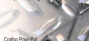
Crafcro Pour Pot with Wheels