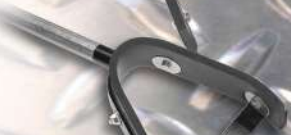
Crafcro Heavy Duty Compact Squeegee