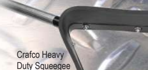
Crafcro Heavy Duty Squeegee

Crafcro Detack is an economical, biodegradable liquid from Crafcro that eliminates sealant tack when sprayed onto freshly applied hot pour sealant.