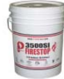
3500SI – Intumescent Spray