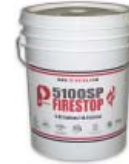
5100SP– Endothermic Spray

PACKAGING 5 us gal. (18.9 L) pail (tapered)